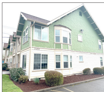
A property in Salem received new siding and a fresh coat of paint.