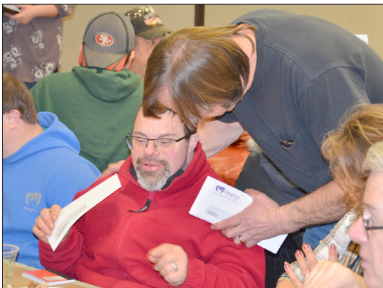
Woodshop employees received their last paycheck during the farewell celebration.