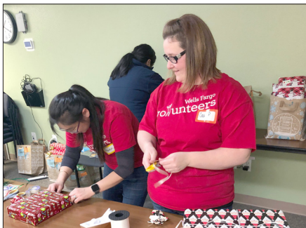
Wells Fargo Call Center team members wrapped the gifts in record time.