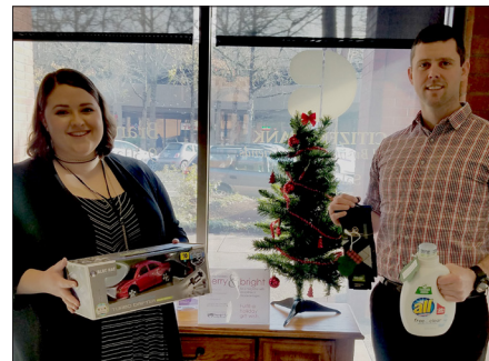
The tree at Citizens Bank in Salem collected a variety of gifts, including household essentials.