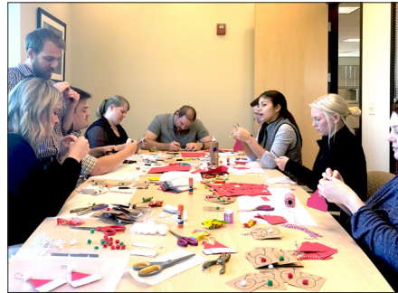
Employees at Philadelphia Insurance busy making ornaments for the Holiday Wishes trees.