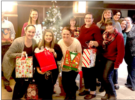
The team at Aldrich CPAs and Advisors show off all of the gifts they collected.

Solutions YES in Portland • Aldrich CPA's & Advisors in Salem • Citizens Bank in Salem • The Eagles Club in Newport • Columbia Bank in Newport • Washington Federal in Florence