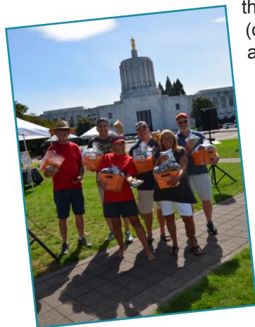
Winners of the double-elimination bracket show off their prize packages

Funds raised from the event have already been put to work providing GED assistance to local parents, community access assistance to people with mental illness, and funding home repair and beautification projects for numerous homes serving people with disabilities.