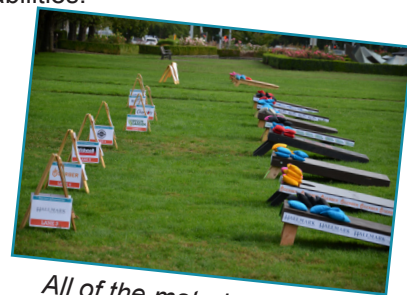
All of the materials needed for the tournament are either made by volunteers or on loan from players and sponsors.