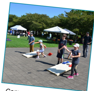
Competitors in the rule breakers division.